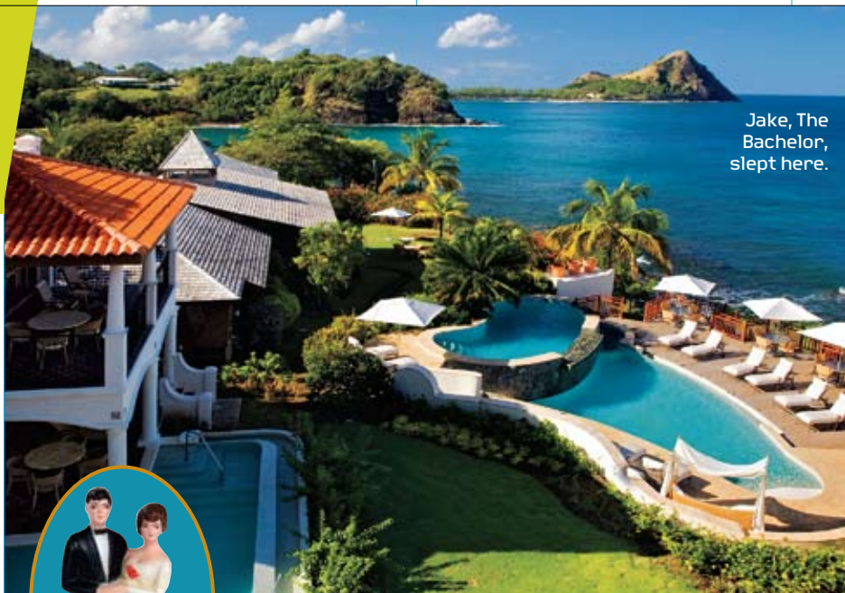
Jake, The Bachelor, slept here.